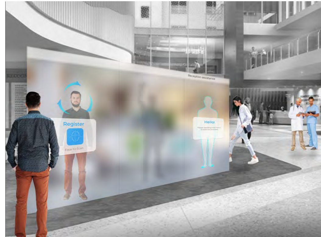
The mirror in hospital lobby help patient with register (public) / body check (semi-public)