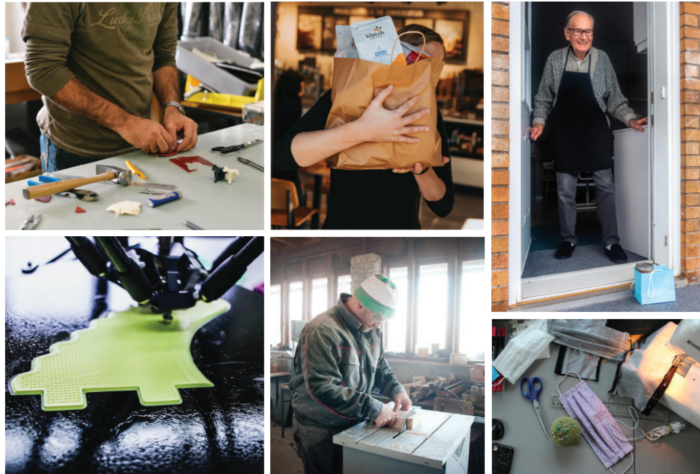
Example images of some of the skills/services that can be used for trading and volunteering.